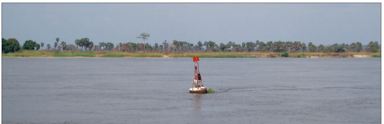
Buoy in the Congo River.

Olex displays onscreen the correction value calculated with the Magellan offset formula (which could be assimilated to RVM pseudogeoid undulation) and computes the water levels using the zero reference of the RVM. Several trial surveys have been performed to check whether the GPS calculation corresponds to the reading of the water levels on the different tide poles along the river. The trials were positive: the tolerance (less than 10cm) was accepted, allowing the hydrographer to avoid any visual readings of the water level on the different limnographic stations.