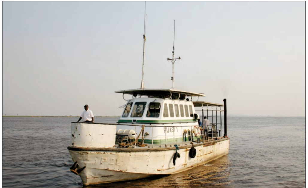
Survey vessel Puasi.

It was confirmed that the sites formerly selected for Syledis were the best locations. Nevertheless, the environment may have greatly changed: vegetation, numerous GSM broadcasting antenna towers, and buildings, which could affect both UHF coverage and GPS satellites reception. All three stations broadcast long-range kinematic code and L1/L2 phases,