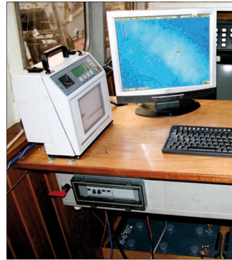
The computer corner for post-processing.

Olex software was chosen for two main reasons: firstly, the robustness of the Linux environment strengthened by the rugged marine PC and, secondly, the ease of use regarding the bathymetric and navigation software that are entirely automatic for data acquisition and provide directly workable survey results (real-time