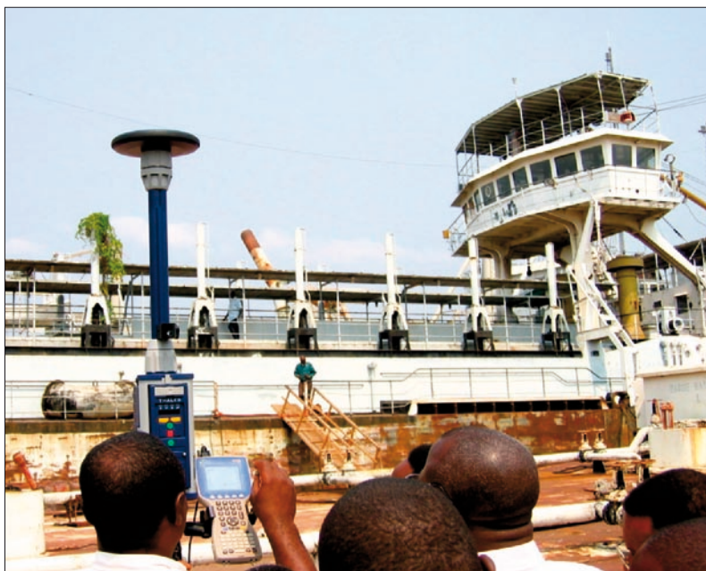
Start of the training.

Cegelec Solutions & Services Company, in partnership with Magellan Navigation (formerly Thales Navigation) for the GPS hardware part and